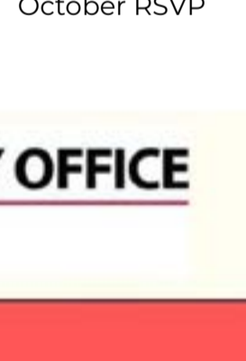
BIPOC Monthly Social October RSVP

The aims of the group are to provide opportunities for BIPOC graduate students to (1) gather in an inclusive intersectional space dedicated to fostering a sense of belonging; (2) facilitate conversations on mental health, and wellness and connect students to culturally relevant university and community services; (3) provide opportunities for students to network in a community of peers and; (3) improve access to leadership and fellowship opportunities. There is dedicated time during each meeting for students to eat, socialize and be in community with each other.